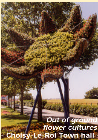
Out of ground flower cultures

It will also play the role of a thermal regulator for the roots of the plant by favoring a ground temperature by several degrees lower than that of ambient air; it will reduce the harmful effects of soil salinity and water irrigation, of the losses through evaporation and percolation and those of scrubbing on the structure of the ground.