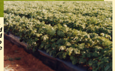
- Morocco - High yield irrigated potato culture