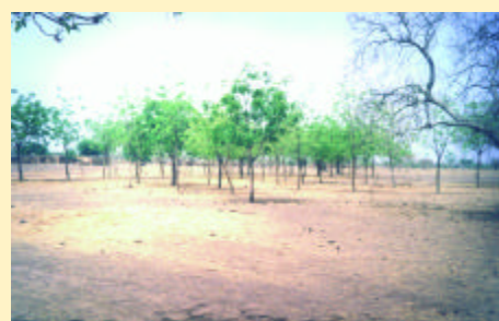
- Burkina Faso - 1998 before Reforestation