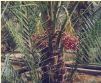
- United Arab Emirates - Date palm