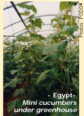
- Egypt - Mini cucumbers under greenhouse

The plant is protected from hydrous stress and/or deficiencies in nutrients. It protects itself against diseases and bacterial attacks. The association of Polyter with the plant favors a fast and harmonious growth of the vegetable fabric (resumption and development), shortens the culture cycle of the species, increases the plant's resistance to diseases and its yield.