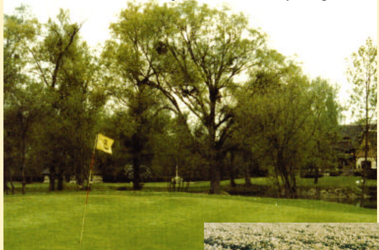
- France - Polyter treatment on sports grounds

Polyter is a hydro retaining Fertilizer with a very high capacity to optimize the needs and development of plants. Polyter's semi-permeable polymeric membrane allows a very quick absorption of liquids which are released very slowly and in small quantities according to local parameters (evaporation and type of vegetable). A procedure of encapsulation specific to the technology makes it possible to join together balanced fertilizing products (N.P.K) and trace elements (Bo. Cu .Fe. Mn. Mo. Zn) within the polymeric chambers.