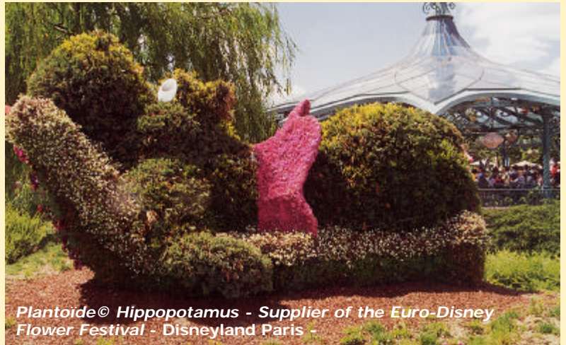
Plantoide© Hippopotamus - Supplier of the Euro-Disney Flower Festival - Disneyland Paris -

The restitution of these essential elements fixed in the particles of Polyter is done mainly towards the plant. The release in the support of culture is infinitesimal, depending on the conditions of the medium (Nature of the soil, temperature, evapo-perspiration).