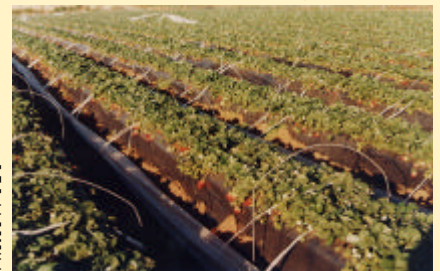
- Morocco - Strawberry culture