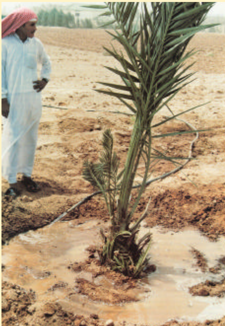
- Middle East - Date palm plantation

Polyter's efficiency is recognized worldwide today in many fields of vegetable production: